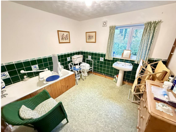
Being half tiled with bath, wash hand basin, toilet, radiator, extractor fan