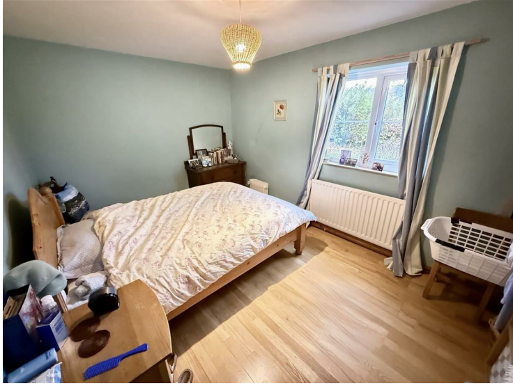
Front window, radiator