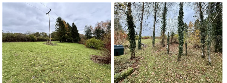
The property is set in mature private gardens and grounds with no near neighbors, being approached by a gated entrance