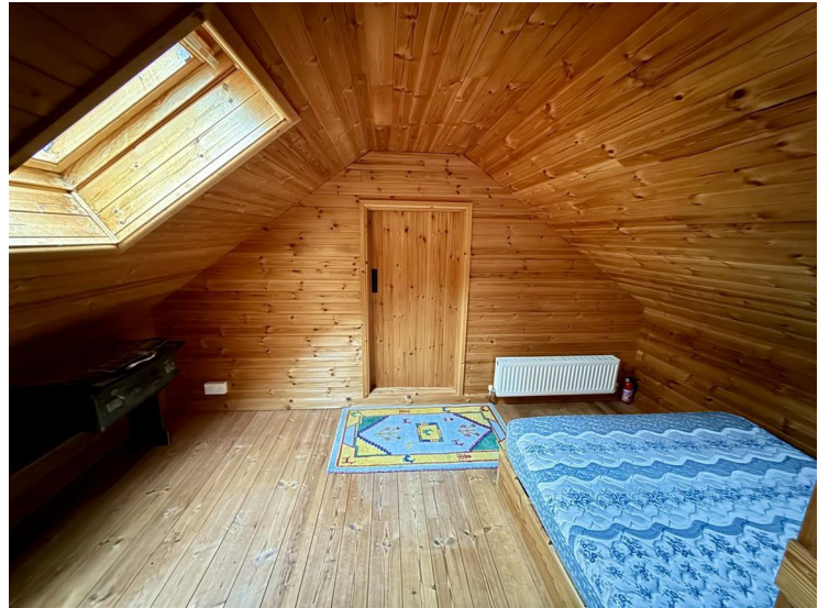
Accessed via a "hit and miss" staircase leading to small landing with access to under eaves storage, Loft Room with tongue and groove ceiling and walls, Velux roof window, Radiator door to: