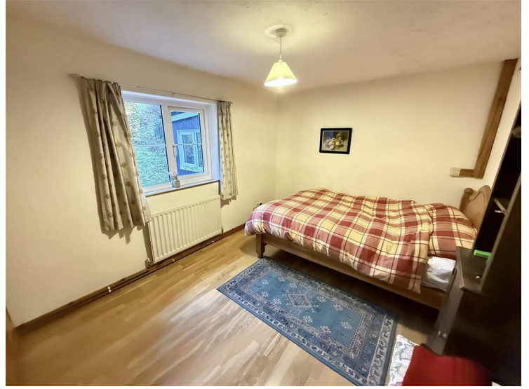
Rear window, radiator